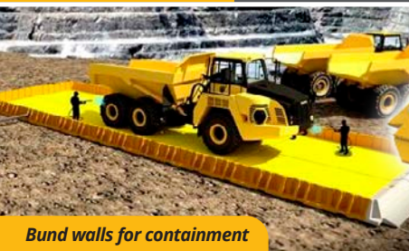
Bund walls for containment