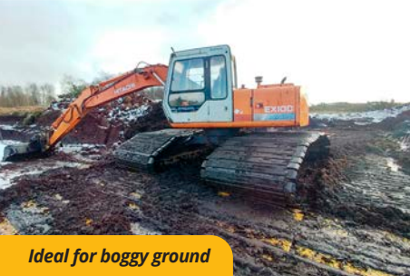
Ideal for boggy ground