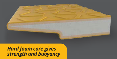
Hard foam core gives strength and buoyancy