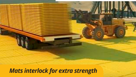
Mats interlock for extra strength

THE ULTIMATE MATTING AND CONTAINMENT SYSTEM