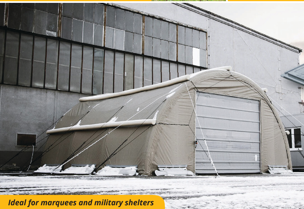
Ideal for marquees and military shelters