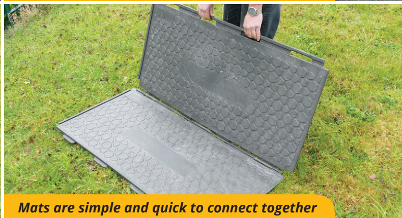
Mats are simple and quick to connect together