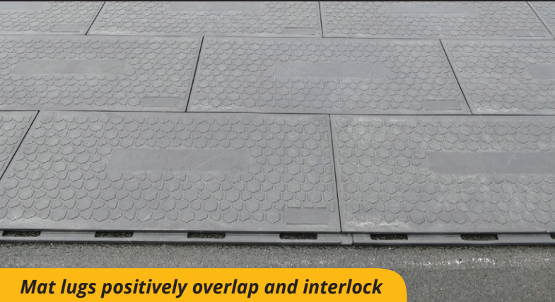
Mat lugs positively overlap and interlock