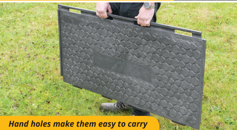
Hand holes make them easy to carry