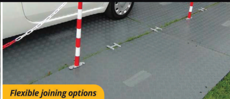
Flexible joining options