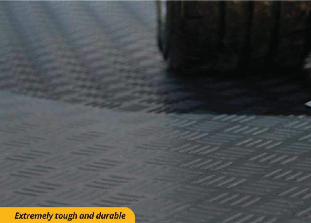
Extremely tough and durable