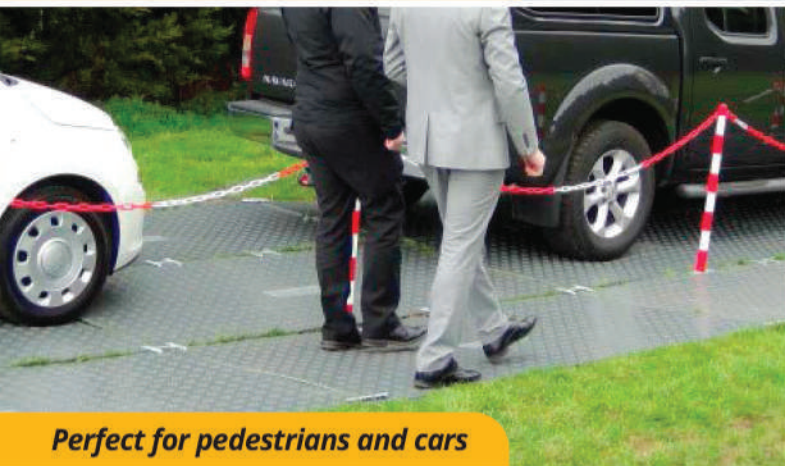
Perfect for pedestrians and cars