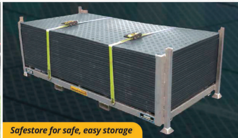
Safestore for safe, easy storage