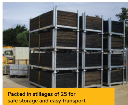
Packed in stillages of 25 for safe storage and easy transport

Material: Recycled HDPE (100% recycled & recyclable)