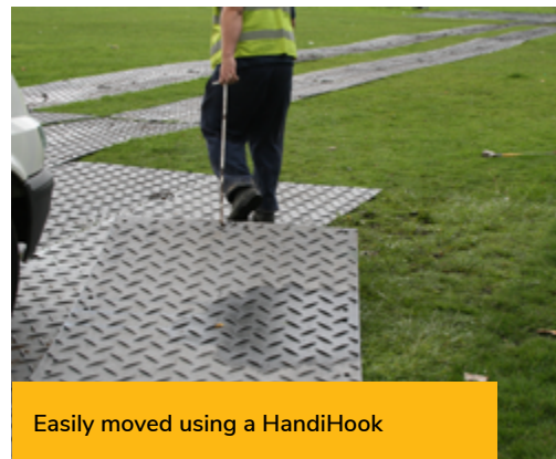
Easily moved using a HandiHook