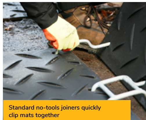
Standard no-tools joiners quickly clip mats together