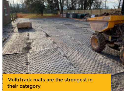
MultiTrack mats are the strongest in their category